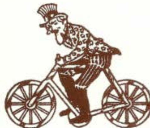
MECHANICAL BIKE RIDERS

The Toy of the Hour. Rides for dear life and right into the hearts of the little ones. Big 25 cent Bike Rider. "Uncle Sam" on his way to Mexico. Length 8¼ inches; height from string 7 inches; heavy weight to balance; moves quickly by raising and lowering the cord.