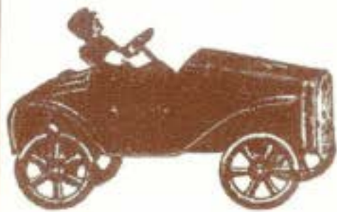
FRICTION AUTO RACER

Every child expects the toy auto to climb hills the same as father's does. For that reason this model is exceedingly popular. Runs either backward or forward. Measures 7 inches in length. Enameled red, trimmed with gilt. Shipping weight 1¼ pounds.